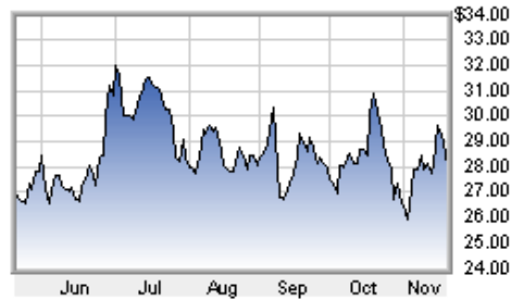
■ AEROVIRONMENT INC as of 11/19/2009